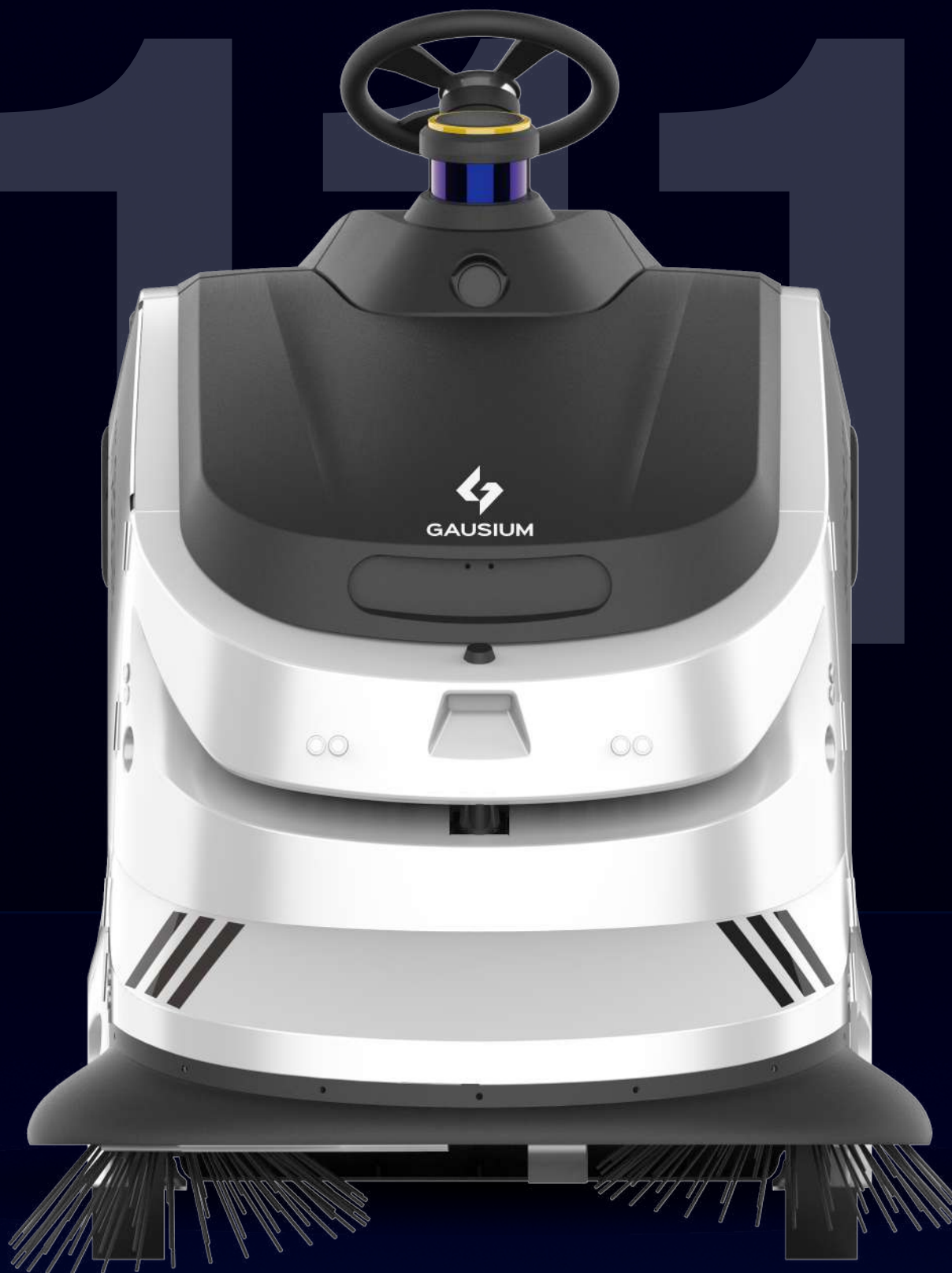
Sweeper 111 High Performer, Whether Indoors or Outdoors